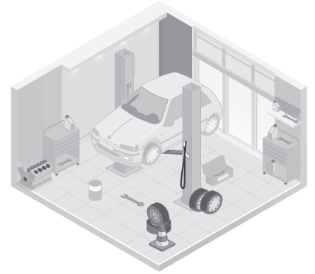
Car Repair Shop